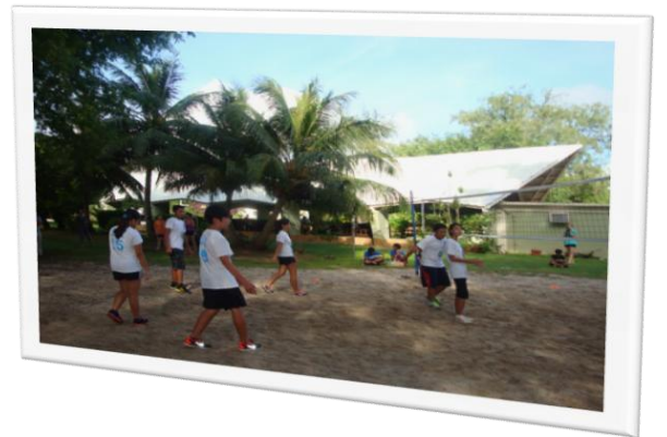
SIS Blue Team at SCS Sand Court is a little tricky